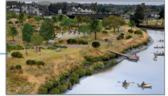
NORTH EAST SITE