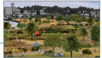
NORTH WEST SITE