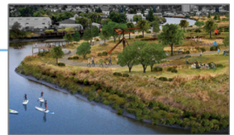
SOUTH EAST SITE